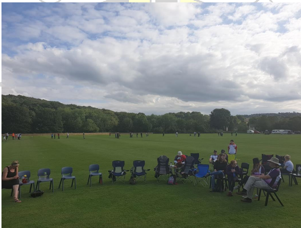
The search begins - most of the archers are in the background looking for the lost arrow

Day two. Essentially a repeat of day one. However, day two did produce a couple of exciting incidents. The first of these occurred when the field party and judges were informed that an archer had missed the target (it does happen) and thought their arrow had gone left and high. Well!! Sometime later, a LOT LATER , around 4hr 44min(ish) later, (after the competition had finished and the field taken down and packed away) and almost all the archers (including two archaeologists) and judges went looking for this arrow, it was found – SHORT AND TO THE RIGHT!!!