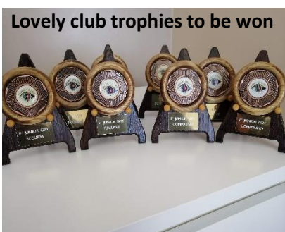
Lovely club trophies to be won