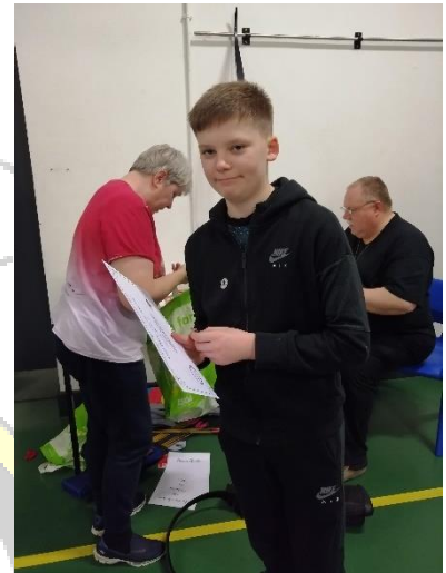
3 rd Place Junior